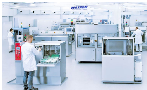
Machine Test Center