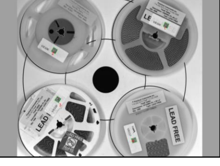
AUTOMATIC BARCODE READER