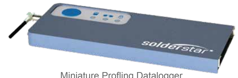
Miniature Profling Datalogger