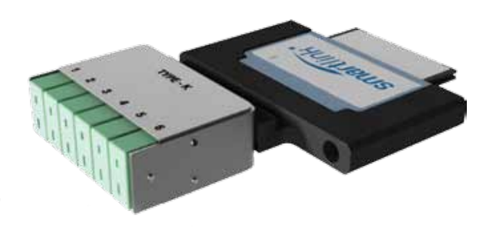
6 Channel Thermocouple Adapter